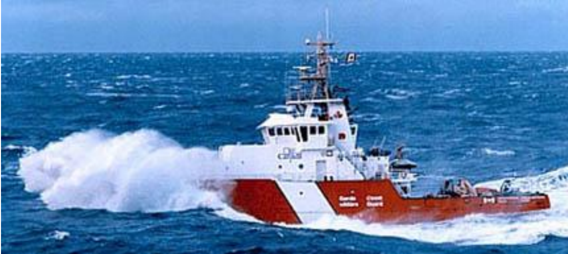
CCGS Gordon Reid with a bone in its teeth